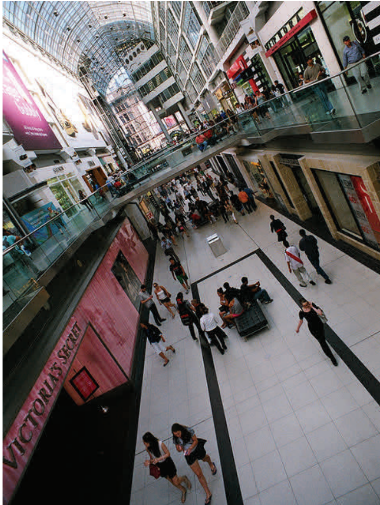
A shopping mall

Finally, his cousin takes him to the mall.